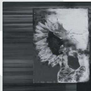
Lowry Awful Joy www.lowrymusic.com