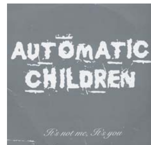
Automatic Children It's Not Me, It's You www.automaticchildren.com